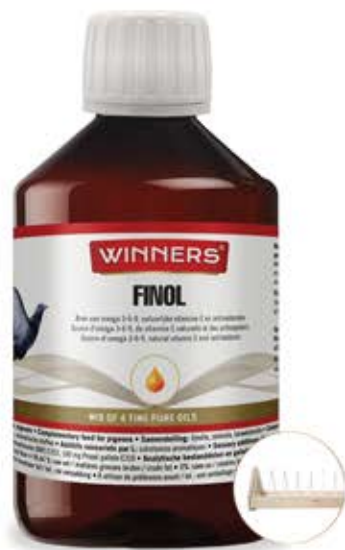
500ml - Art. n° 81156