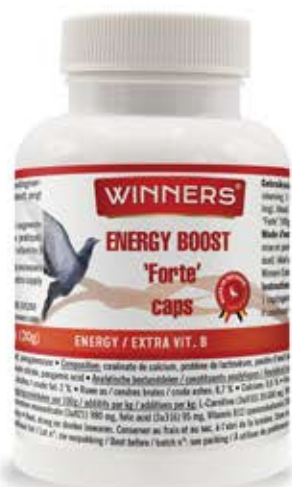
180 caps - Art. n° 81209

For an additional boost, feed 1 tablet of Energy Boost Tabs per pigeon in the last 2 days before basketing.