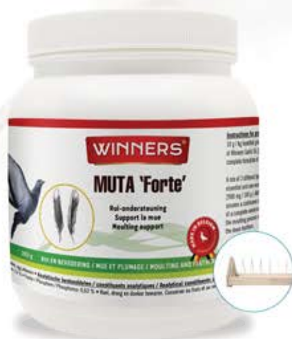
350g - Art. n° 81188

During moulting: 4 x per week until the last quill feather is fully grown.