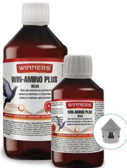
1L - Art n° 81234 250ml - Art n° 81235

In severe weather conditions: replace the Winchol with the Finol – 1 tablespoon/kg food.