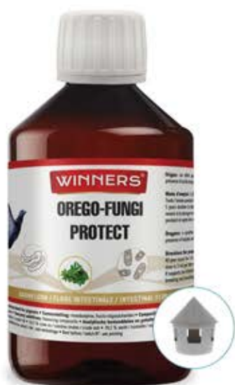
450ml - Art. n° 81231