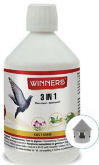
500ml - Art. n° 81013