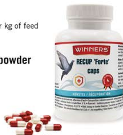
180 caps - Art. n° 81201

Winners Recup "Forte" Caps, in combination with Recup "Forte" powder in the drinking water of pigeons, ensures a faster recovery of their muscles after heavy exertion. Recup "Forte" Caps is not a substitute for the Recup "Forte" powder. Important: 1 capsule/pigeon as soon as possible after returning home.