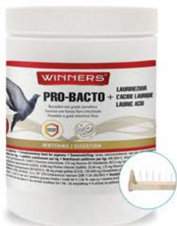
500g - Art. n° 81018

Instructions: Preventive: 1.5 ml per liter of drinking water, 3 days a week, all year round. If necessary, double the dose to 3 ml per liter of water for 4 to 5 days and then return to the normal dose. It supports intestinal health during and after the races, during breeding and moulting.