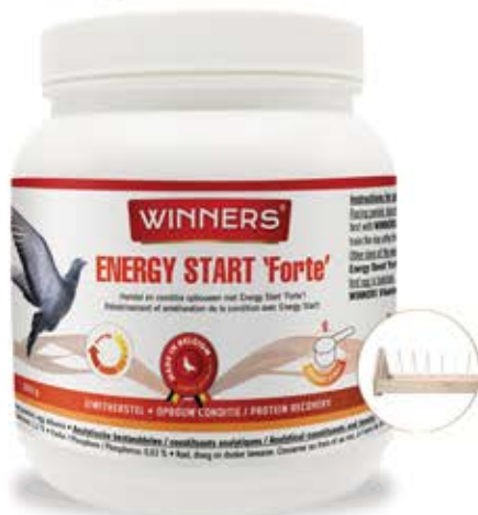
350g - Art. n° 81186