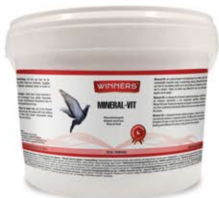
2,5kg - Art. n° 81151