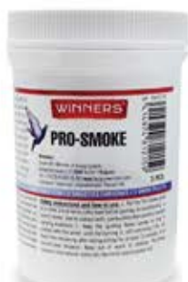
3 pcs - Art. n° 81215