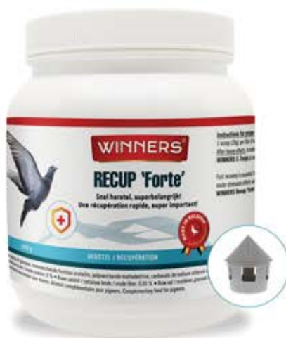
500g - Art. n° 81184

TIP: in warm weather, 3 days before baskeing, add E-Trolyt to the drinking water at a rate of 20 g/l