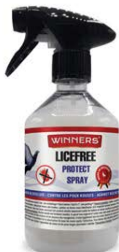
500ml - Art. n° 81214