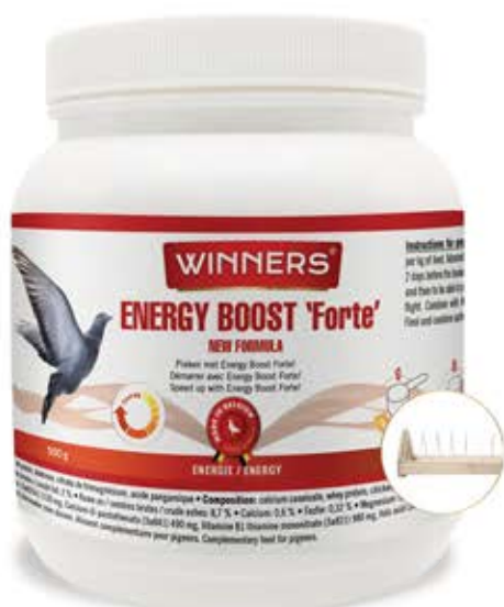
500g - Art. n° 81185

Instructions: in the water: 2 x per week 5ml / L drinking water. Do not combine with supplements containing copper or iron.