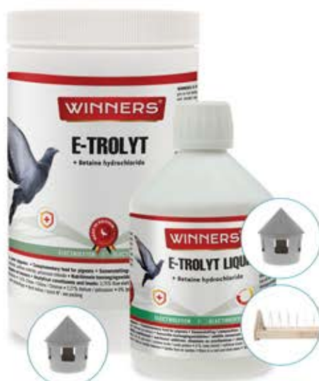
700g - Art. n° 81154 500ml - Art n° 81236