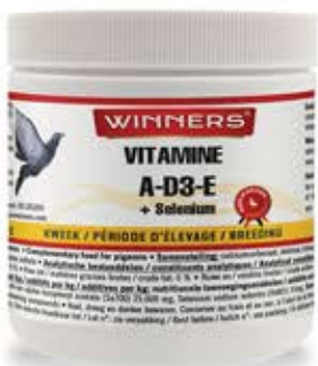
250g - Art. n° 81212