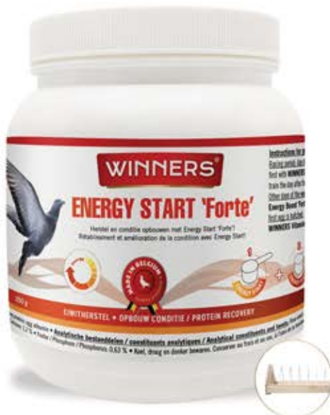
350g - Art. n° 81186