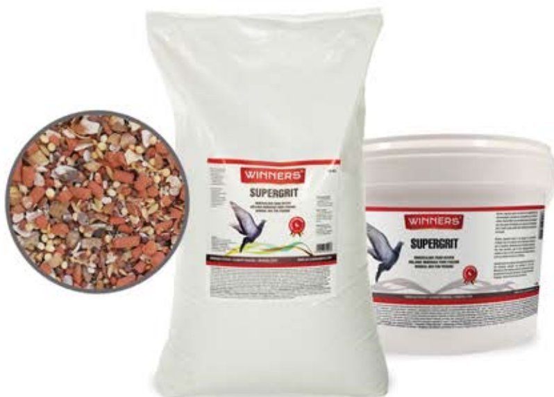
4kg - Art. n° 81202 20kg - Art. n° 81237

Instructions: Can be used all year round. Provide a small amount of these fresh vitamins daily.