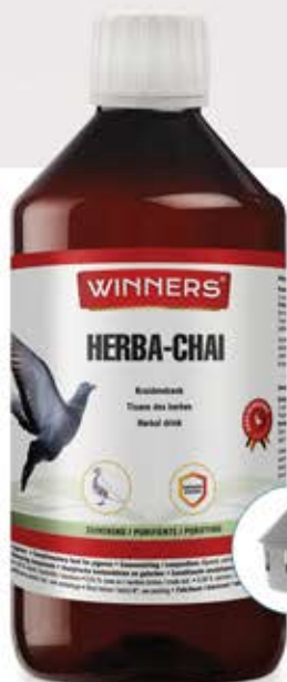
1L - Art. n° 81155