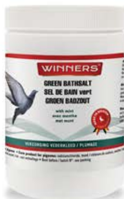
600g - Art. n° 81064