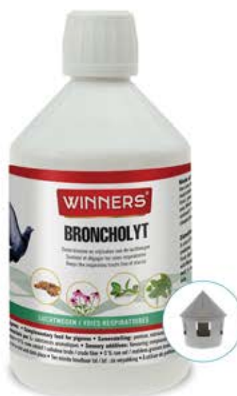
500ml - Art. n° 81003

Care during the sports season or relapse of flying: Winners 3 + 1 (10 ml) + Winners Broncholyt (15 ml) + Winners Broncho-Drops (10 drops) per liter of drinking water, three-weekly for 3 consecutive days. In case of loss of appetite: see startup phase.