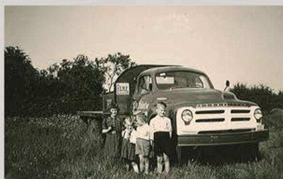
History in animal feed sales since 1947

In Belgium, subsidiary Belphar med bv, as a wholesaler, takes care of the logistical distribution of the supplements, while in the Netherlands, subsidiary TNL Pharma bv, as a pharmaceutical wholesaler, takes care of the distribution of the medicines. The production department Orovet bv develops and produces its own brands as well as private label products. And Avimedis bv takes the online strategy under its wings. With this structure of companies, Group Lataire plays with a certain focus a leading role in the niche of pigeon racing.