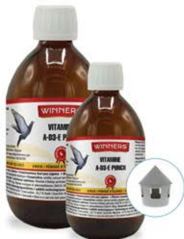
250ml - Art. n° 81222 450ml - Art. n° 81221