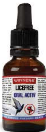
50ml - Art. n° 81232