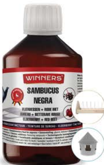
500ml - Art. n° 81216