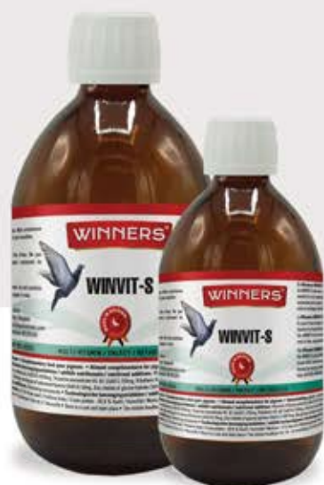
450 ml - Art. n° 81229 250 ml - Art. n° 81230