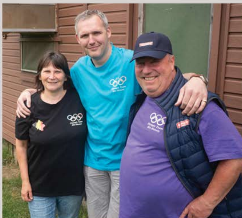
TANDEM MIR-BENOIS-LIBOTTE, BASSILLY