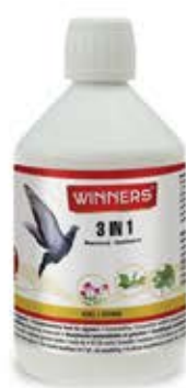
3 in 1

TIP: Use in combination with Winners E-Trolyt or Winners Recup 'Forte' in the drinking water or in combination with Winners Broncholyt and Winners 3 in 1 in the drinking water.