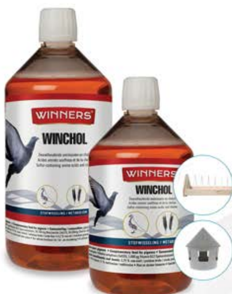
1L - Art. n° 81020 500ml - Art. n° 81023